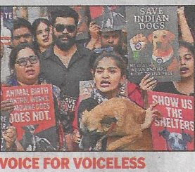
VOICE FOR VOICELESS

Maharashtra recorded the highest number (2,356) of such cases, followed by Madhya Pradesh (1,346), Uttar Pradesh (1,121), Gujarat (526) and Tamil Nadu (457). The data tracks cases under the Prevention of Cruelty to Ani-